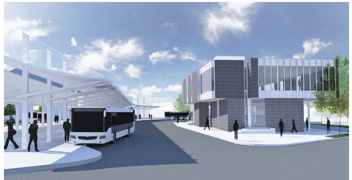
An architectural rendering from the southeast of the current OTC and the OTC Expansion Project.

On the main floor, the new terminal will host a ticketing and information counter, plus public restrooms and an indoor waiting area for transit customers to stay dry and warm. On the second floor, the terminal will house driver breakrooms, as well as staff conference rooms and offices to support Intercity Transit operations.