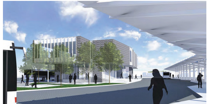
View from the southwest