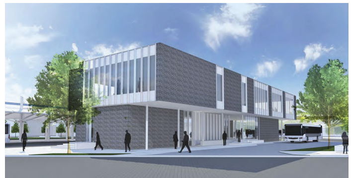
View from the northeast