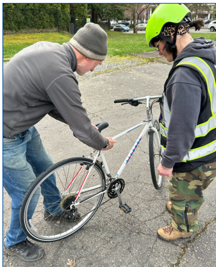
(Left) Full Cycle Bike Distribution at Plum Street Village.