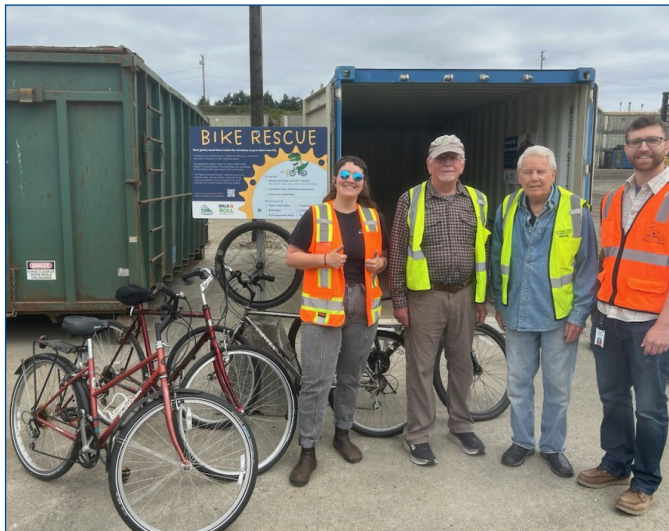
(Above) New donation site at the WARC.