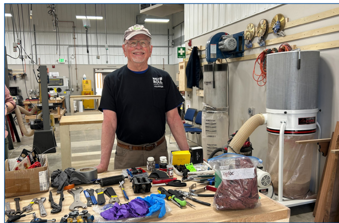
Bike repair at the Thurston County Fix-It-Fair