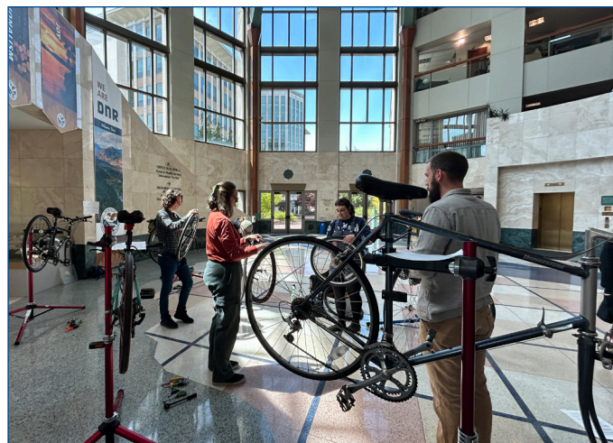
Fix-a-Flat class at Washington Department of Fish and Wildlife.