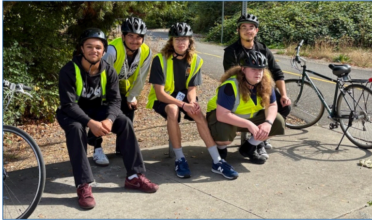
Envision bike education students.