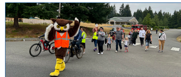
Walk N Roll to School at McLane Elementary