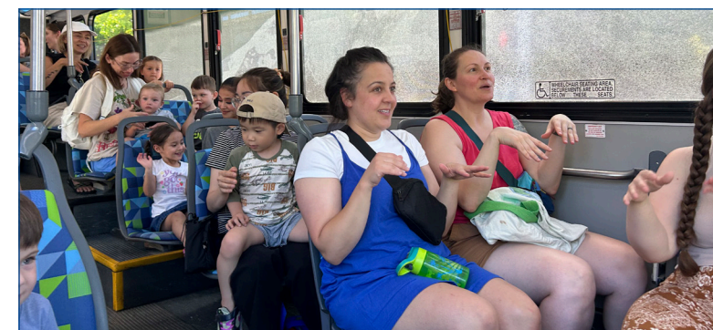
Participants enjoying a Rolling Sotrytime on the bus.