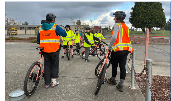
TBD instructors preparing students for a group bike ride.