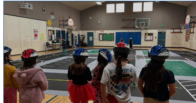
The Mobile Traffic Garden at Lydia Hawk Elementary.

A traffic garden is a miniature streetscape that includes realistic traffic features such as intersections, roundabouts and crosswalks. The garden provides an environment for children to learn and practice bicycle and pedestrian safety skills free from motorized vehicles.