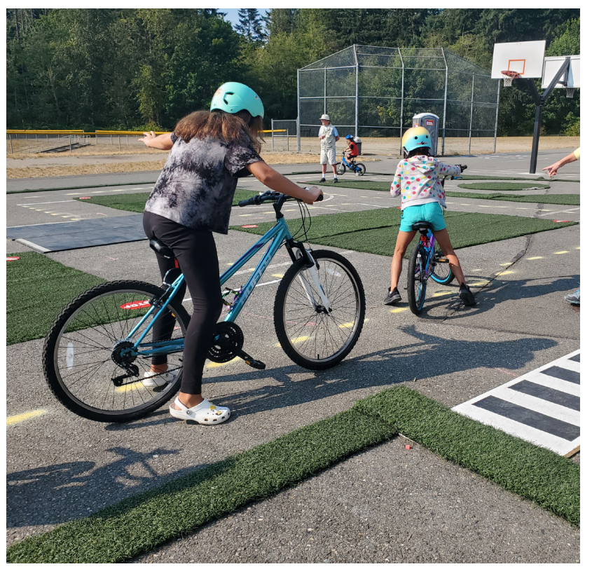
Mobile Traffic Garden at YMCA Summer Camp.