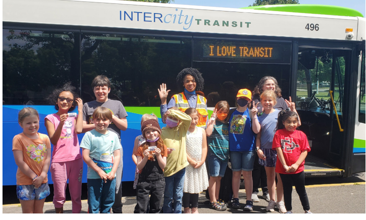
We took Summit Virtual Academy on a Rolling Classroom field trip.