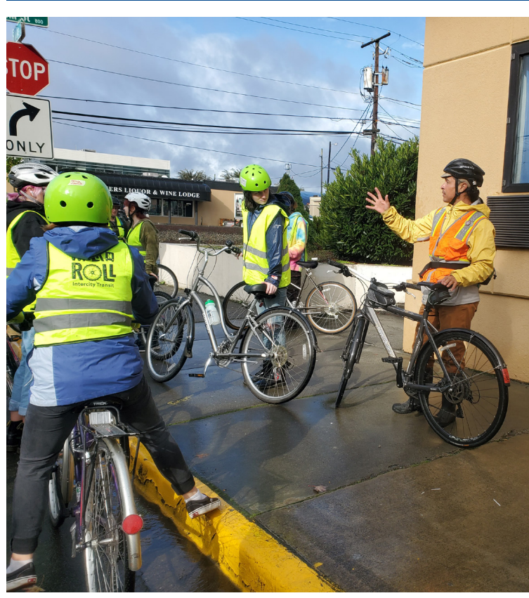
Avanti students learning and practicing bicycle safety skills.