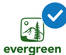
Maintains late night service