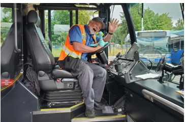
Meet a bus driver video