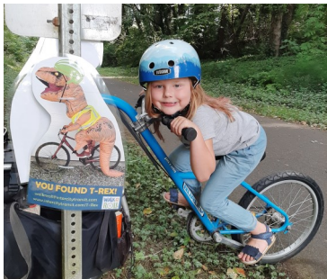
T-Rex scavenger hunt