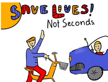
Yard sign art contest