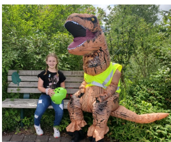
T-Rex safety video