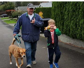
Youth Walk Challenge