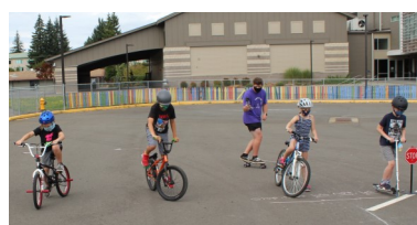
Mini bike rodeo