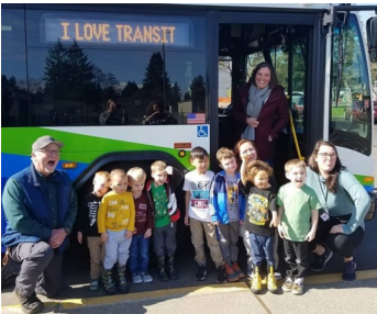
Mt. View Preschool