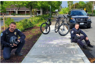
OPD at Roosevelt