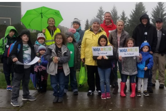
Walk N Roll to School