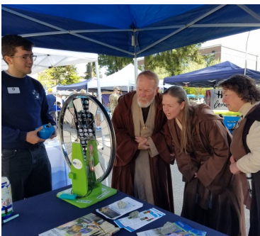
Safety education at STEM Fair.