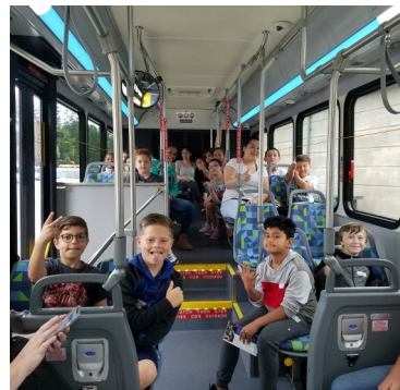
Rolling Classroom field trip.