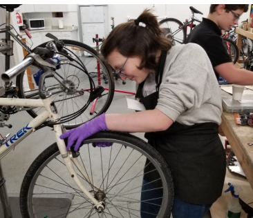
Student learning bike mechanic skills.