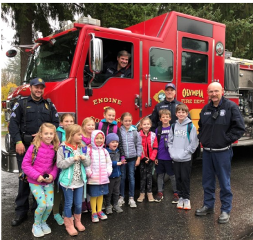
Walk N Roll to School at Pioneer.