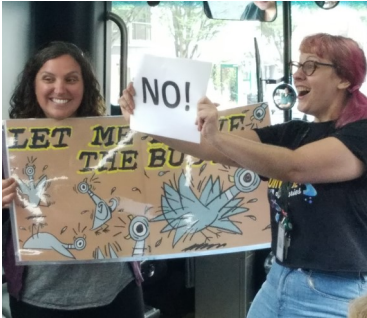
Rolling Storytime with the library.