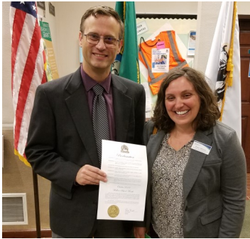
City of Tumwater proclamation.