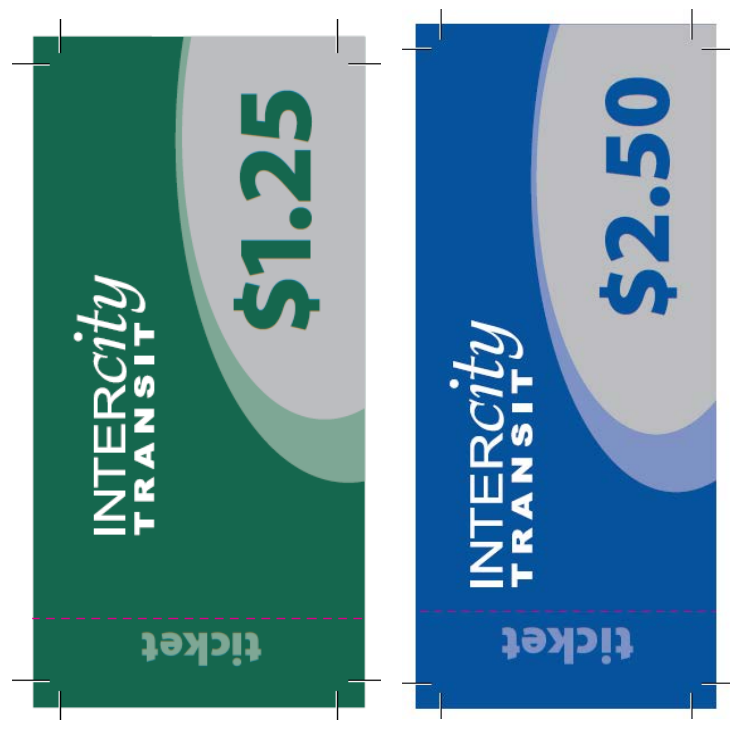
Gray area denotes an area of void pantograph printing.

Sample: The pass design is similar as shown below: