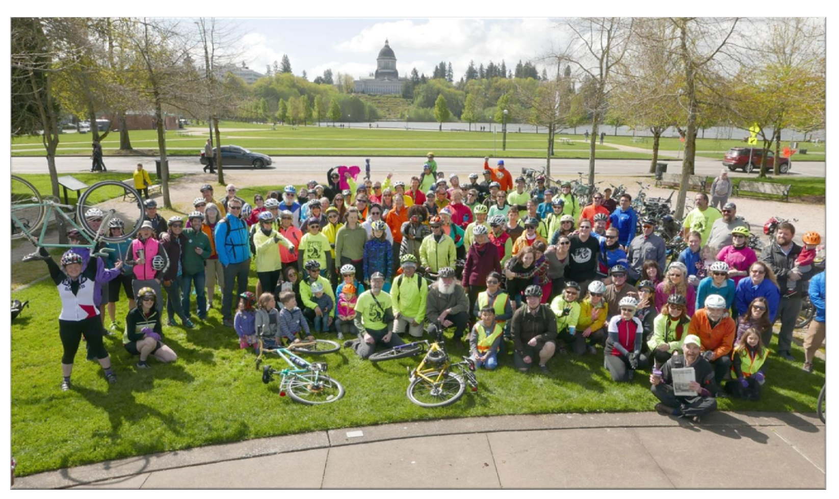
Over 100 Riders and a perfect day.