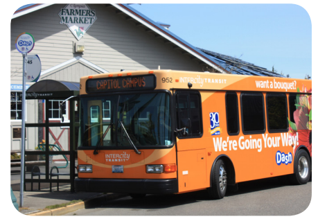
Dash serves downtown Olympia from the Farmers Market to the Capitol Campus and everywhere in between!

To schedule a ride, call 360.705.5840 Monday through Friday from 8 a.m. - 3 p.m. You can also leave a message and we will return your call the following business day to confirm your ride.